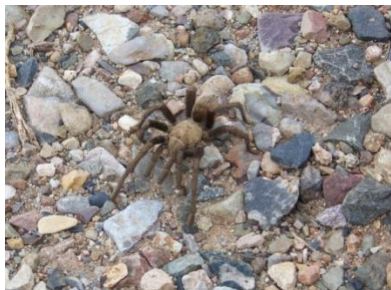
One of our furry 8-legged visitors!

We have our first estate Zinfandel that we will release once the 2008 Cabernet is finished up – probably the weekend of Feb 18-20. We only have 25 cases of this, so we expect it to move pretty fast.