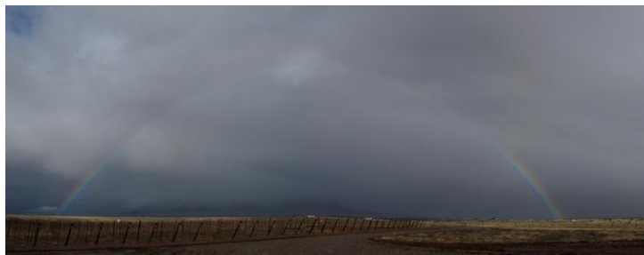
Winter rainbow over the vineyard

those who stopped by on Feb 5-6, when we had no running water, and thus no bathroom facilities. The water lines are fixable, but we are a bit apprehensive on what impact those temperatures might have on the vineyards. Most vines don't care to spend much time at single digit temps. We are keeping our fingers crossed. We'll know the full impact in about 6 weeks, when the vines start to awaken.