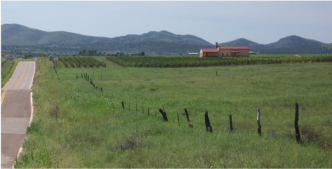
Lightning Ridge Cellars, during Monsoon season.