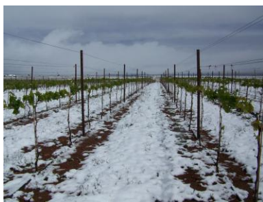
An unusual sight in late April...but didn't harm the vines. We were not so lucky the next week.

We are proud to announce that our 2007 Zinfandel recently was awarded a Silver Medal in the National Women Winemaker's Competition, held in Santa Rosa, CA. We have been enjoying this wine for the last year, as it has evolved from somewhat of a "fruit bomb" when bottled in April of 2009, to a more complex mix of fruit, pepper, and smoke at the present time. So, we certainly agree with the panel judges on this one! The good news is that we've got about 40 cases of this wine still in stock.